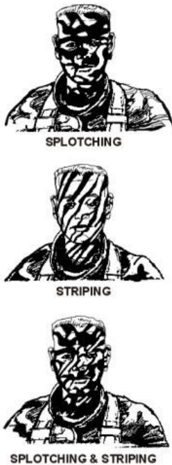
Figure 4-3. Face Camouflage.