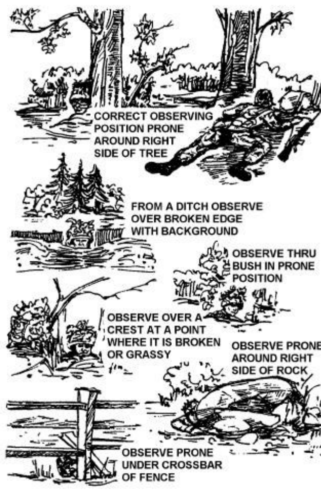
Figure 4-1. Correct Use of Cover.

necessary, around the side of or, if possible, through an object.