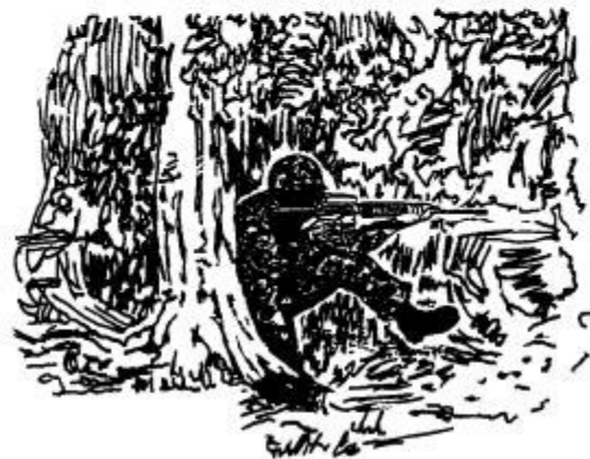
Figure 4-2. Avoid Contrasting Backgrounds.