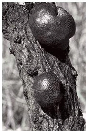
(from the web)